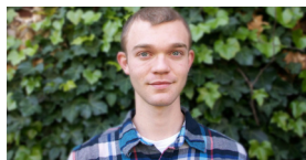
BOBBY SWITZER Miller 1