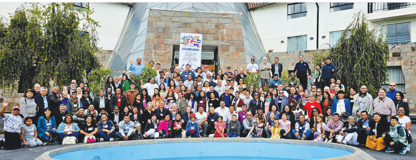
Participants at the Cusco 500 gathering in January 2025.