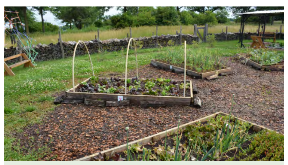
Merry Lea Teaching Farm garden: lettuce, onions, kohlrabi, various other greens and more!

If you're eager to explore a comprehensive collection of the delightful produce we cultivate at Rieth Village, we invite you to visit goshen.edu/merrylea/food-grown-at-ml/. Alternatively, you can simply park your vehicle in the Rieth Village parking lot and embark on a short walk through