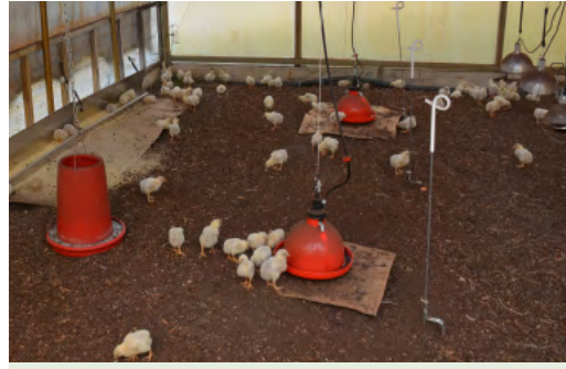
Some of the newest Merry Lea members in their coop - chicks!

We have a large amount of produce currently growing including tomatoes, apples, grapes, pears, melons, peaches, asparagus, gooseberries, strawberries, onions, mixed salad greens, spinach, pumpkins, summer and winter squash, radishes, blackberries, mushrooms, radishes, eggplant, beans (snap & dry), carrots, cauliflower, broccoli, celery, cilantro, basil, dill, parsley, mint, peppers, garlic, cucumbers, zucchini, various cover crops, and flowers!