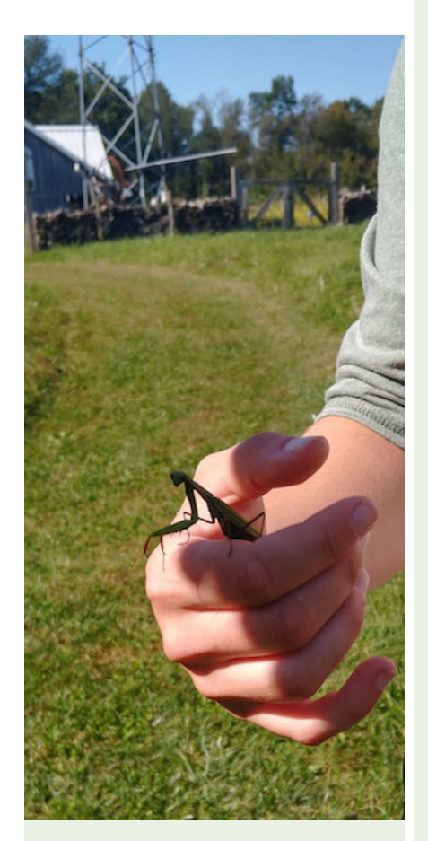
A surprise encounter with a praying mantis provides a break from the hard work of building a sustainable future.

The students I interviewed had foraged for mushrooms and seen bald eagles. They'd begun a day's paddling by dipping their fingers into the Elkhart River and savoring the quality of light. They'd crafted fresh vegetables from the Merry Lea Sustainable Farm into fun meals. Then, they'd cleaned up the dishes together. Whatever failures they'd witnessed, whatever the disillusionment they may have suffered, it was masked by the fact that they'd had a roaring good time. May we all end our semesters—and our lives—on that note.