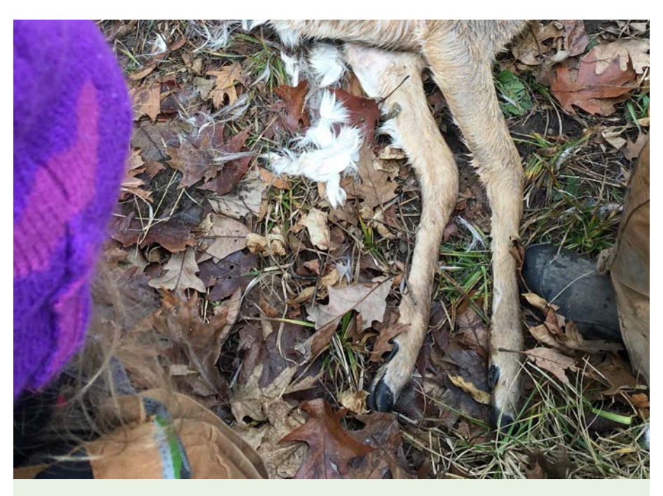
Children in Merry Lea's Nature Preschool encountered a dead deer on a walk. It not only provided food for decomposers; it also provided much food for thought.

* The Reggio approach is an educational philosophy emphasizing self-directed, experiential learning at the preschool and primary level.