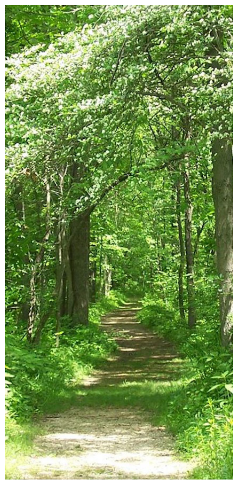
The hiking trails at Merry Lea stretch over eight miles and are open to the public everyday from sunrise to sunset. Most of the trails are concentrated on the east side of the property, around and between the Learning Center Building, Farmstead Site, and Rieth Village. They wind through thick forests, around lakes and wetlands, and through prairies, shrub carr and meadows. Since the whole of Merry Lea property is considered a classroom for learners all along the age spectrum, the trails are designed to give access to the various ecosystems and wildlife that inhabit this 1,189-acre natural sanctuary.

While the trails are used for children's field trips, undergraduate and graduate research projects, and training future environmental educators, a lesser-known population also uses the trails: the general public. This is a population that is difficult to keep track of because casual hikers may come in the early morning, evening or weekends when staff aren't around. Trail users are invited to sign in at the information kiosks located at the Learning