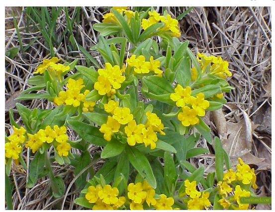
Hoary puccoon, Lithospermum canescens , now blooms in the spring on the Luckey's Landing sand dunes. To learn more about native wildflowers, see Smith's blog, http://wildflowersnearyou.blogspot.com.

In 2002, Bill Minter, director of land management, began restoration of a second degraded black oak savanna at Merry Lea-the North Sand Hill Savanna. This site is located on what was an ancient sand dune system running along the northeast edge of High Lake. More recently, it was pasture. After removing the woody understory which consisted mostly of invasive shrubs, the overstory trees were selectively thinned to create an open, park-like stand of black oak trees. This provided the right balance of sun and shade required for herbaceous (non-woody) plants native to savannas to reestablish themselves. Periodic controlled burns have been performed on the site to mimic the historic role that fire played in maintaining the partially