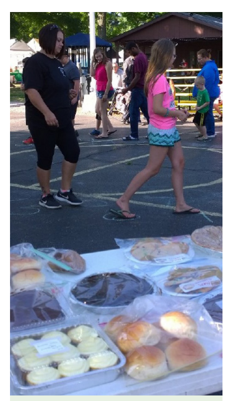
Many Wolf Lake volunteers provide baked goods for a cake walk at the Onion Days festival that takes place each August.

Merry Lea is located a mile or two south of the town of Wolf Lake, an unincorporated village that straddles Route 33. About 2,000 people live within five miles of Wolf Lake.