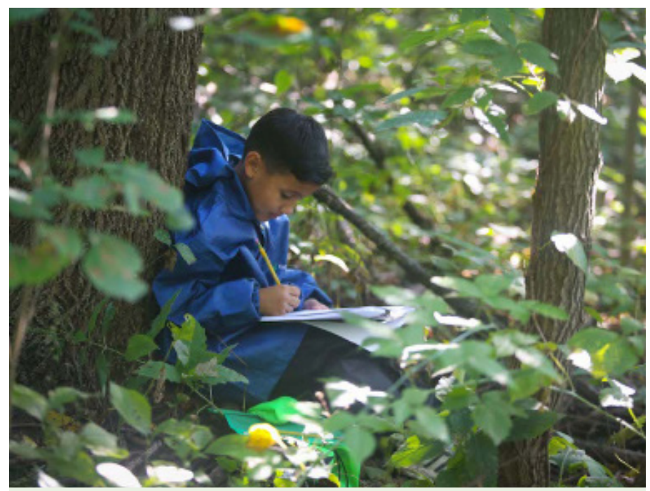
A child in Goshen College's Lab Kindergarten writes in a nature journal during a Kinderforest program.